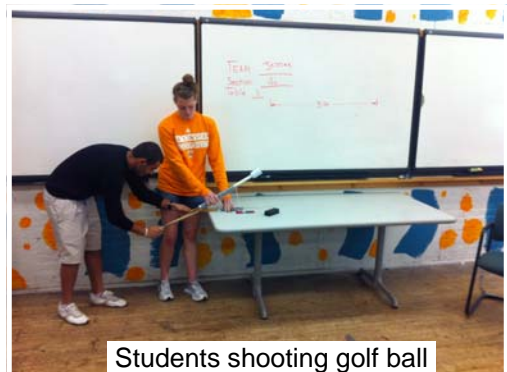
Students shooting golf ball

Engineering Fundamentals is one of five groups using iPads as part of the Office of Instructional Technology's mLearning program. We were given 25 iPads for use in our recitations. In one activity, students recorded the motion of a plastic golf ball as it was shot from a shooter they built. The Video Physics app from Vernier was used to digitize the motion. Students could then see velocity and acceleration in both the horizontal and vertical direction. You can watch a video on the use of the iPads at http://www.youtube.com/watch?v=UQS7a-1K_EQ .